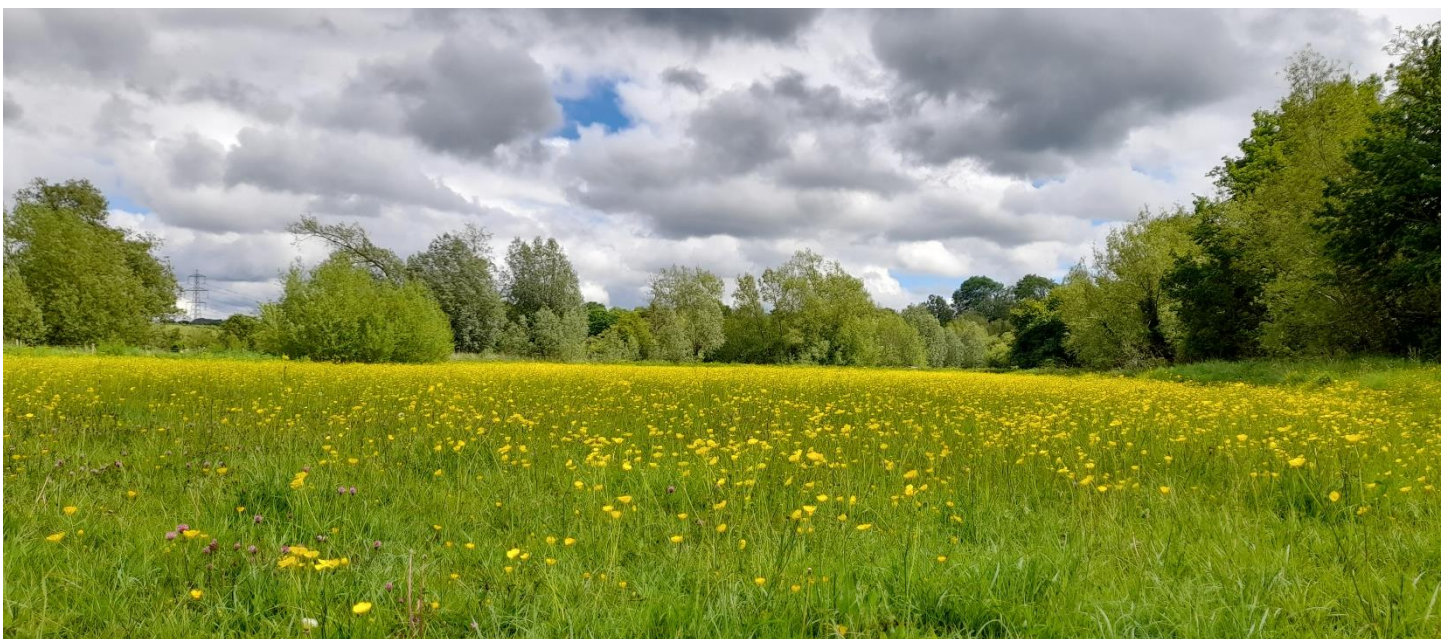
The Water Meadow's annual buttercup display!

supplier. In order to keep the river path accessible and start to fulfil our promised paths management, we borrowed a RTV mounted flail from another team and used it, with some difficulty due to breakages, its size and large pivot point on the hitch, to mow the paths. It was adequate as a temporary emergency measure, but the smaller, more nimble sit on mower will be easier to transport and will enable us to do the job properly and without wasting time fixing things.