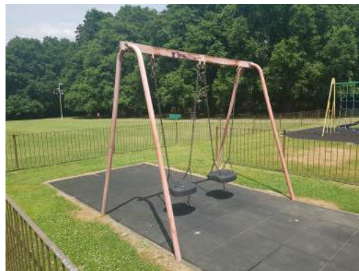
Existing swings to be refurbished and toddler swings to be relocated next to the bigger swings (swings swapped over so bigger swings are closer to the large climbing structure)