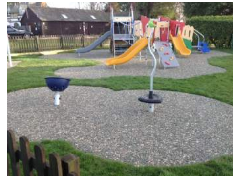
Rubber mulch safety surface in three different colours provides a durable, permeable and natural looking surface around the structures

This design aims to meet the requirements of HPC to create a fun and varied play space for a wide range of ages and abilities. Circles of rubber mulch create a visually interesting and contemporary layout and provide individual safety surface zones for each piece of equipment. The climbing and play equipment for the older and younger children have been located at opposite sides of the space to separate the age groups. A tarmac path connects to the existing entrance area and links to all the elements to ensure the perimeter grass has minimal wear.