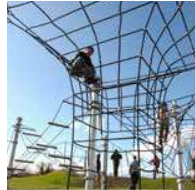
Large bespoke creative climbing structure with central funnel net and four net elements with different levels of challenge for older children