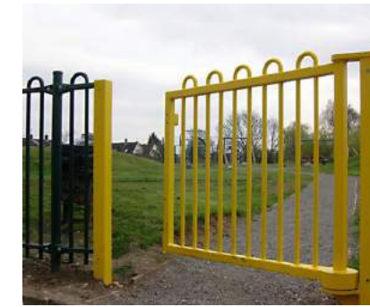
Wide DDA compliant gate