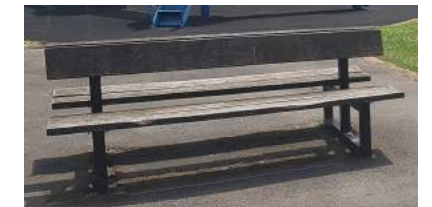
Existing benches to be refurbished and relocated