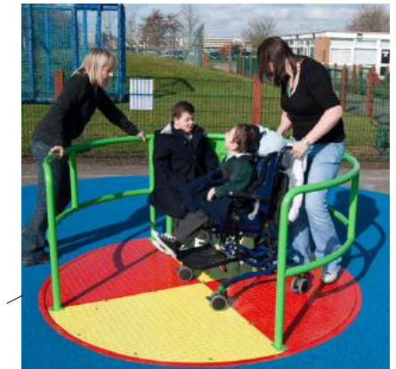
DDA compliant roundabout