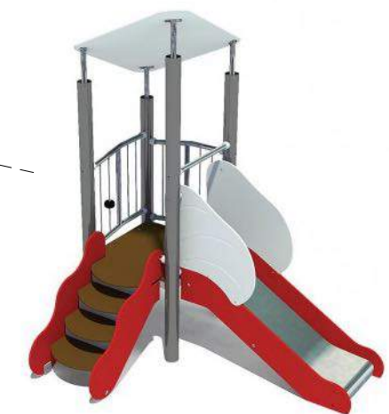
Smaller climbing unit with slide