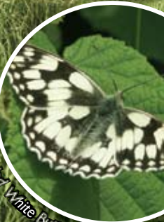
Marbled White Butterfly