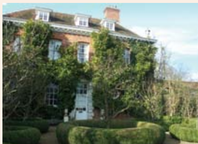
West Green House

On leaving the house, continue on path through an iron gate for about 500m. Cross road, take the track past Borough Court House. At the house entrance, turn right through gates across the fields and across the bridge. Turn