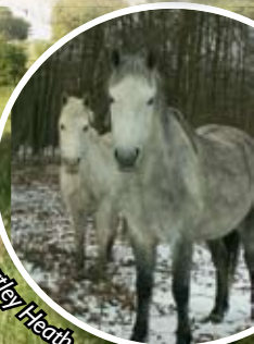
Horses on Bartley Heath